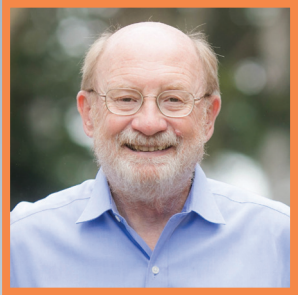
Senate District 17 JOHN LAIRD

CA State Assembly Asamblea Estatal de CA