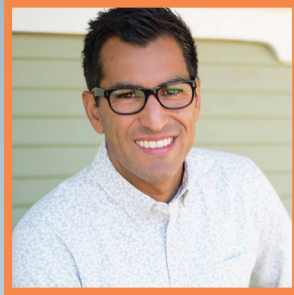
Assembly District 29 ROBERT RIVAS

CA State Assembly Asamblea Estatal de CA