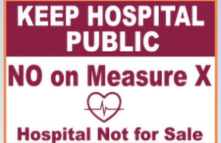
NO on Measure X NO a la Medida X